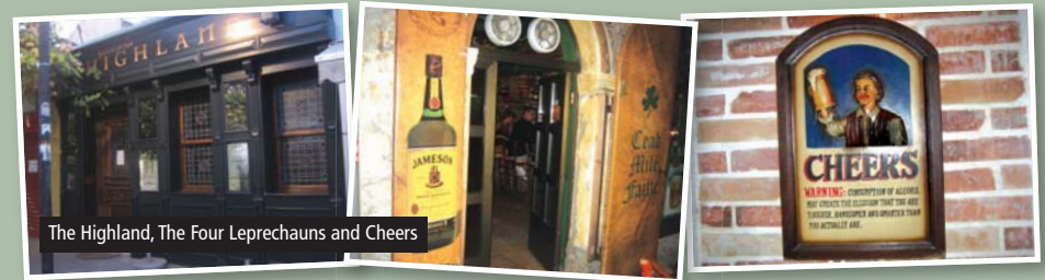
The Highland, The Four Leprechauns and Cheers

The nearest thing to pubs can be found, almost inevitably, in the form of Irish bars and also one Scottish pub (traditional football rivalry means we sometimes hesitate to mention Scottish pubs, but it didn't seem to hold many