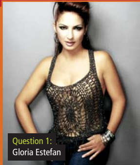
Question 1: Gloria Estefan